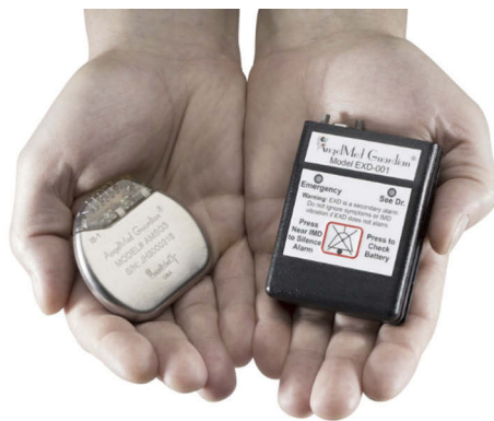
Figure 2 Implantable medical device (IMD) and external medical device (EXD).